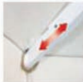
Free of folds: the shade struts can be extended so that the cloth remains ideally stretched at all times.