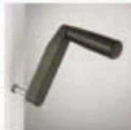
Opening and closing: it is quick and easy to get the knack of turning it.