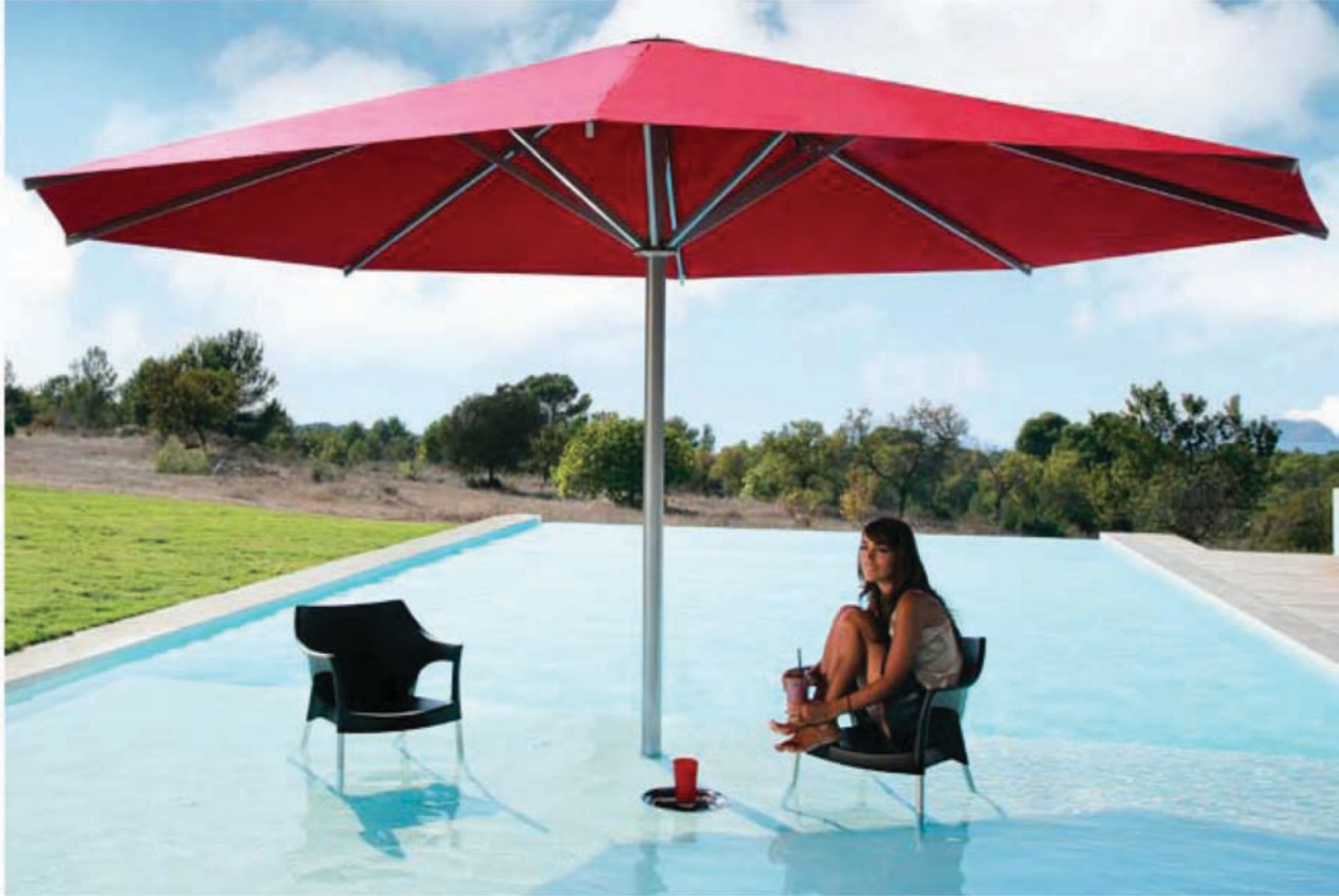
luminescent 3914 dark red.

When it gets cooler later on, the attachable infrared radiators generate pleasant warmth.