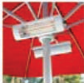
Brings warmth to cool night-time hours: radiant heater on the shade.