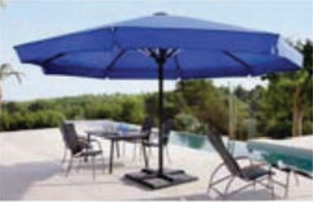
8202 mediterrane with attached valance and integrated lighting.

Available with a span width of up to six metres, this is big in format. It provides cover for everyone even there are a lot of guests. On terraces of restaurants, cafés and ice cream parlours it signals from a distance that people are sitting comfortably and secure.