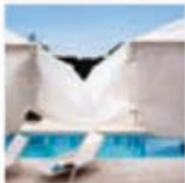
Raingutters between two shades increase the protected area.